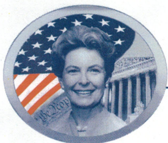
Phyllis Schlafly Founder